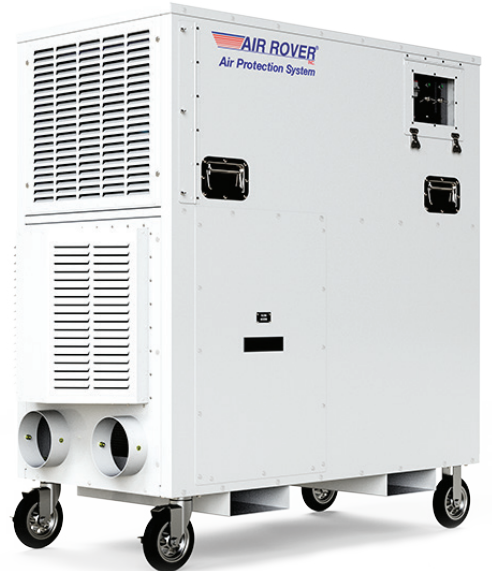
Indoor Grille System